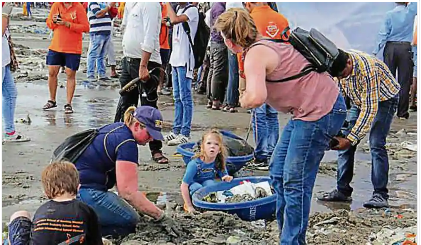
Volunteers at Versova beach on Saturday.